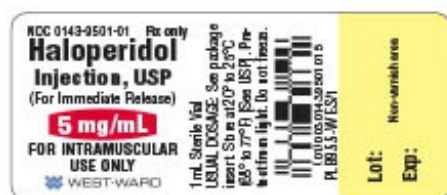
Haloperidol Injection, USP 5 mg/mL Vial Label