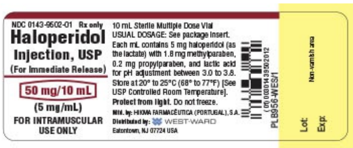
Haloperidol Injection, USP 50 mg/10 mL Vial Label

NDC 0143-9502-01 Rx only Haloperidol Injection, USP (For Immediate Release) 50 mg/10 mL (5 mg/mL) FOR INTRAMUSCULAR USE ONLY