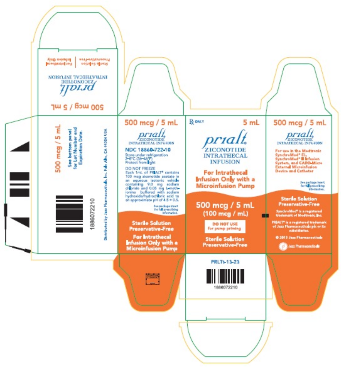
Carton - 5 mL