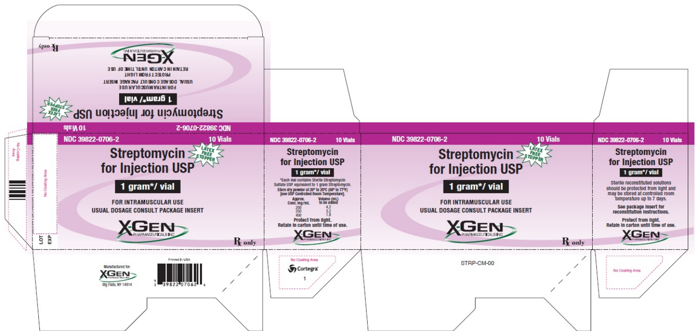
10 pack carton